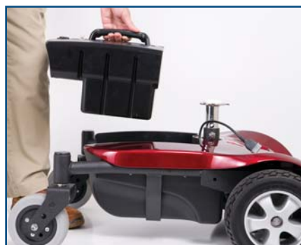
Pull the battery pack out of the base

Literature is current at time of printing. Golden Technologies reserves the right to make changes to the product or literature at any time.