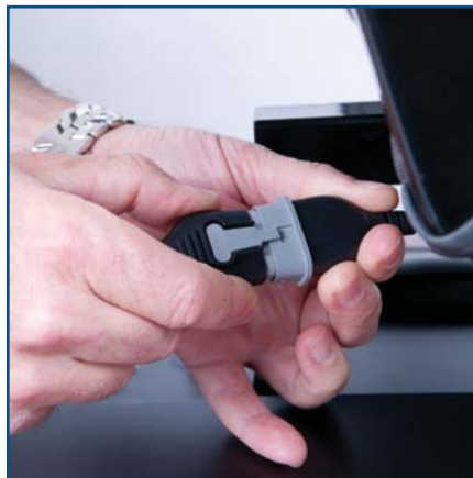
Disconnect the controller wire